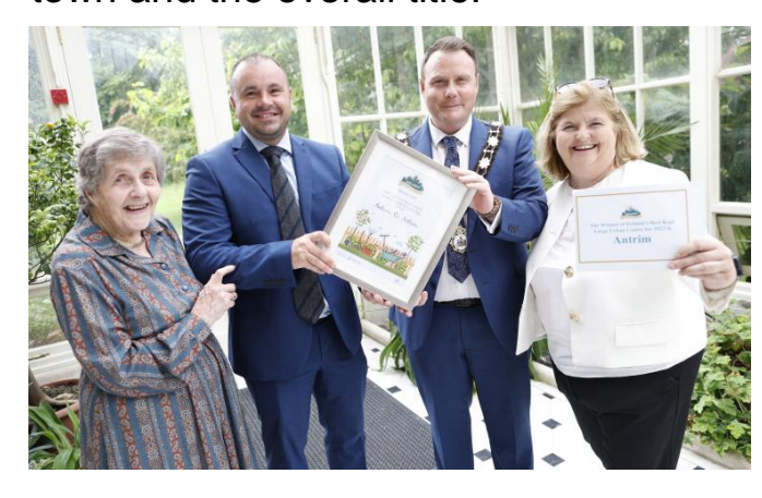
Antrim took the tile of Ireland's Best Kept Large Urban Centre.