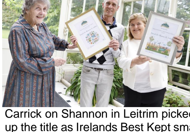
Carrick on Shannon in Leitrim picked up the title as Irelands Best Kept small town and the overall title.