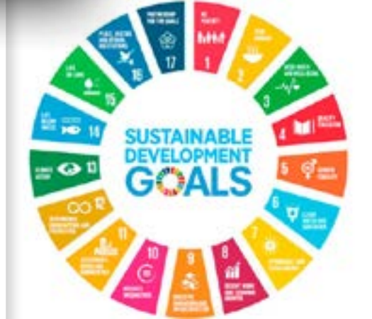
Supporting the Sustainable Development Goals