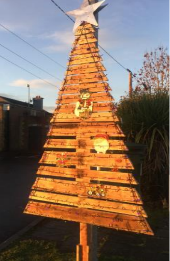
Well done to all in Kilbride TidyTowns. https://m.facebook.com/kilbridetidytowns/

Also in the January issue, we brought you a piece from Summerhill TidyTowns, also from County Meath. They told us how they collaborated with Vincent de Paul, Third Age, Summerhill Community Centre and Sona Sasta (Meals on Wheels) and distributed 255 book bundles locally. They also worked with Dangan National School