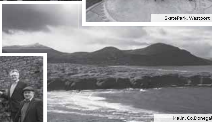
Malin, Co. Donegal