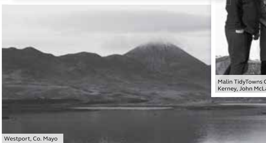
Westport, Co. Mayo